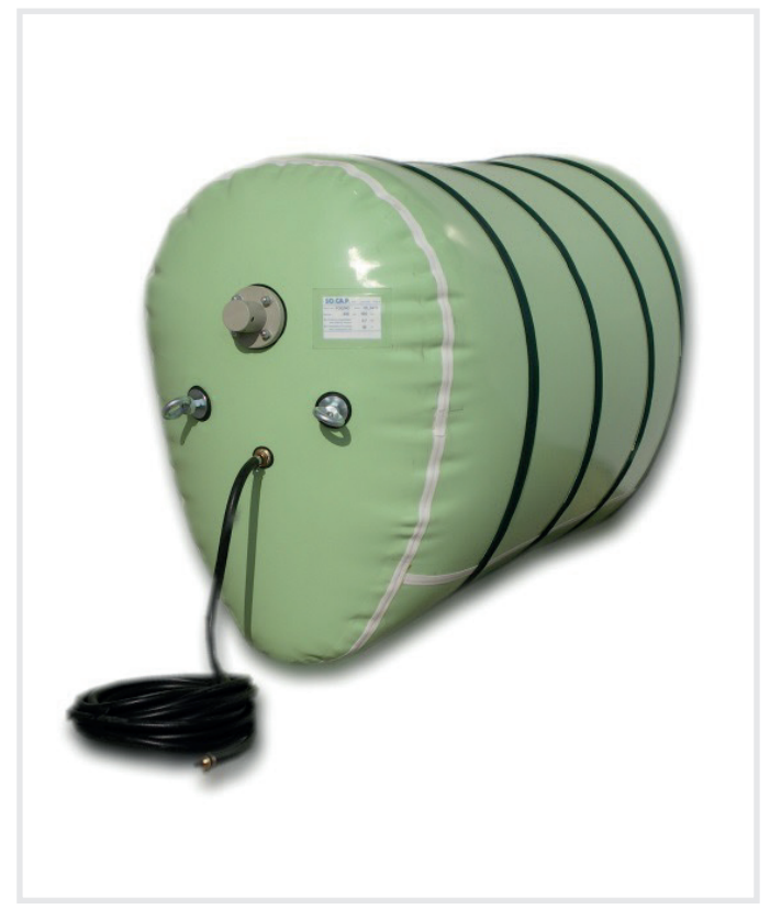
Figure 1 - Pneumatic Stopper

This stopper is made with synthetic fabric coated on both faces with plastomers resistant to water based and non corrosive liquids.